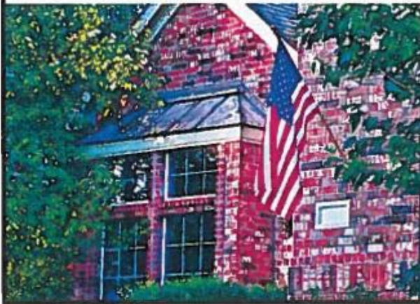
Flying my flag on holidays