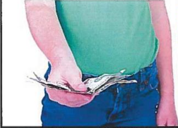
Turning in money I find to the school principal