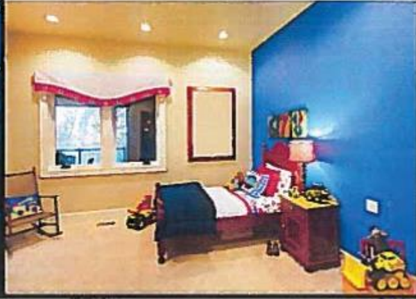
Leaving all of the lights on when I leave my room