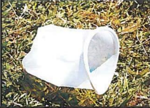
Leaving a mess on the ground after a picnic